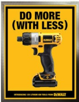
BOLD 1 3/8" WIDE METAL FRAME

CONTEMPORARY & INDUSTRIAL CARBON STEEL FINISH