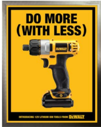
12x16 FRAME (PICTURES SHOWN, NOT TO SCALE)

FOR CURRENT PRICING, VISIT THE ID # LISTED ABOVE