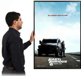
20x20 FRAME (PICTURES SHOWN, NOT TO SCALE)

FOR CURRENT PRICING, VISIT THE ID # LISTED ABOVE