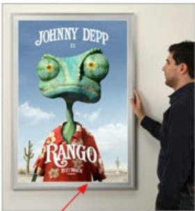
DECORATIVE MATBOARD (Color will Compliment Frame)