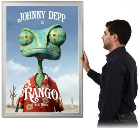
27x41 FRAME (PICTURES SHOWN, NOT TO SCALE)

FOR CURRENT PRICING, VISIT THE ID # LISTED ABOVE