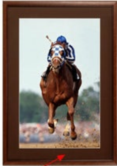
DECORATIVE MATBOARD (24+ COLORS AVAILABLE)