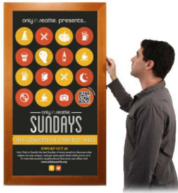
12x20 FRAME (PICTURES SHOWN, NOT TO SCALE)

FOR CURRENT PRICING, VISIT THE ID # LISTED ABOVE