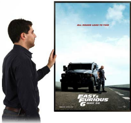
12x20 FRAME (PICTURES SHOWN, NOT TO SCALE)

FOR CURRENT PRICING, VISIT THE ID # LISTED ABOVE