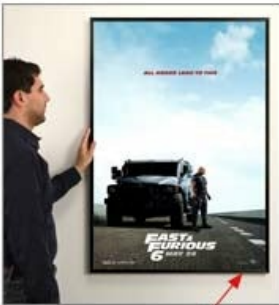
7/16" WIDE SQUARE FRAME PROFILE