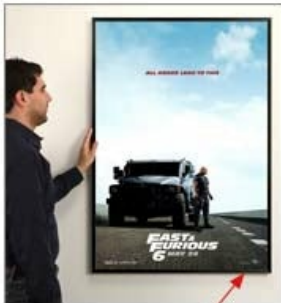
7/16" WIDE SQUARE FRAME PROFILE