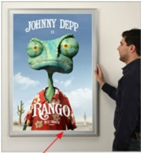
DECORATIVE MATBOARD (Color will Compliment Frame)