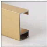
7 Metal Finishes (Satin & Polished)