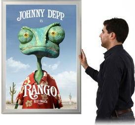
36x42 FRAME (PICTURES SHOWN, NOT TO SCALE)

FOR CURRENT PRICING, VISIT THE ID # LISTED ABOVE