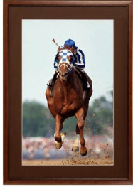
17x22 FRAME (PICTURES SHOWN, NOT TO SCALE)

FOR CURRENT PRICING, VISIT THE ID # LISTED ABOVE