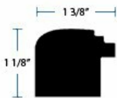
9 Wood Finishes