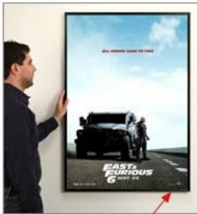
7/16" WIDE SQUARE FRAME PROFILE