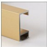
7 Metal Finishes (Satin & Polished)