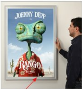
DECORATIVE MATBOARD (Color will Compliment Frame)