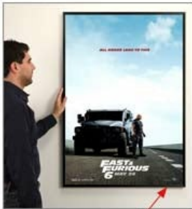
7/16" WIDE SQUARE FRAME PROFILE