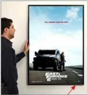
7/16" WIDE SQUARE FRAME PROFILE