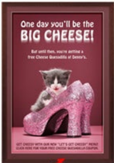
DECORATIVE MATBOARD (24+ COLORS AVAILABLE)