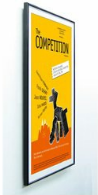
SLIM TO WALL PROFILE ONLY 1" DEEP