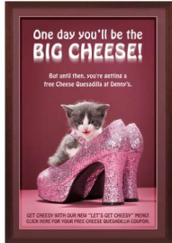
36x48 FRAME (PICTURES SHOWN, NOT TO SCALE)

FOR CURRENT PRICING, VISIT THE ID # LISTED ABOVE