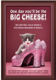
15x22 FRAME (PICTURES SHOWN, NOT TO SCALE)

FOR CURRENT PRICING, VISIT THE ID # LISTED ABOVE