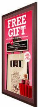
SLIM TO WALL PROFILE ONLY 3/4" DEEP