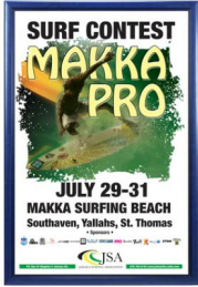
18x18 FRAME (PICTURES SHOWN, NOT TO SCALE)

FOR CURRENT PRICING, VISIT THE ID # LISTED ABOVE