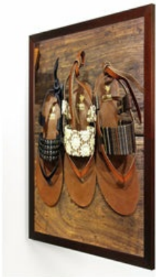
SLIM TO WALL PROFILE ONLY 7/8" DEEP