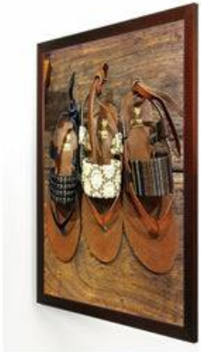
SLIM TO WALL PROFILE ONLY 7/8" DEEP