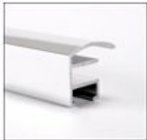
4 Metal Finishes (Black, Silver, Satin & Polished Gold)