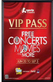
14x22 FRAME [PICTURES SHOWN, NOT TO SCALE]

FOR CURRENT PRICING, VISIT THE ID # LISTED ABOVE