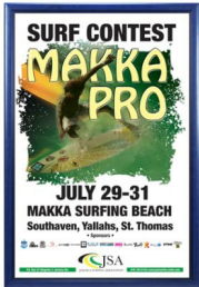
14x22 FRAME (PICTURES SHOWN, NOT TO SCALE)

FOR CURRENT PRICING, VISIT THE ID # LISTED ABOVE