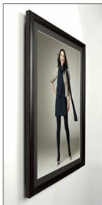
SLIM TO WALL PROFILE ONLY 1 1/8\"