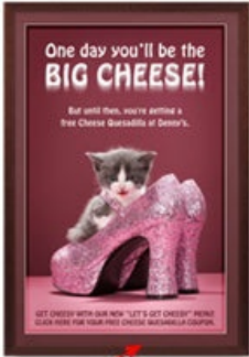
DECORATIVE MATBOARD (24+ COLORS AVAILABLE)