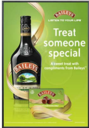
16x16 FRAME (PICTURES SHOWN, NOT TO SCALE)

FOR CURRENT PRICING, VISIT THE ID # LISTED ABOVE