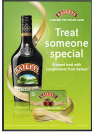
18x24 FRAME (PICTURES SHOWN, NOT TO SCALE)

FOR CURRENT PRICING, VISIT THE ID # LISTED ABOVE