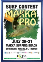
20x28 FRAME (PICTURES SHOWN, NOT TO SCALE)

FOR CURRENT PRICING, VISIT THE ID # LISTED ABOVE