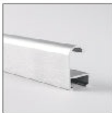
6 Metal Finishes (Satin & Polished)