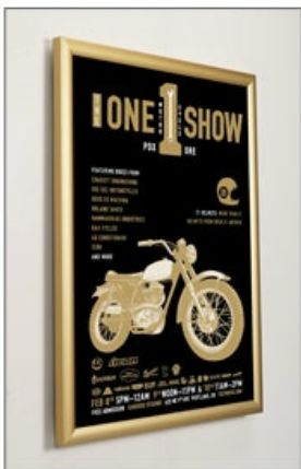
SLIM TO WALL PROFILE ONLY 7/8" DEEP