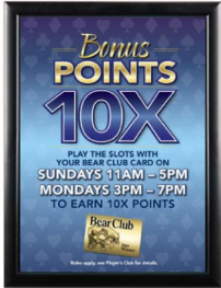
18x18 FRAME (PICTURES SHOWN, NOT TO SCALE)

FOR CURRENT PRICING, VISIT THE ID # LISTED ABOVE