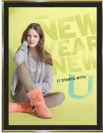
16x16 FRAME (PICTURES SHOWN, NOT TO SCALE)

FOR CURRENT PRICING, VISIT THE ID # LISTED ABOVE