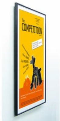
SLIM TO WALL PROFILE ONLY 1" DEEP