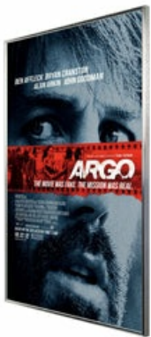
SLIM TO WALL PROFILE ONLY 1" DEEP