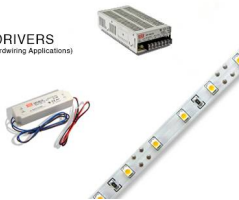
DRIVERS (for Hardwiring Applications)

Standard UPPERCASE Black Helvetica Lettering as detailed above. Make sure to spell out your header in the empty Text Box above the SAVE SELECTIONS button. Check your grammar & spelling!