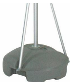
Fill Base with Water or Sand for Added Stability