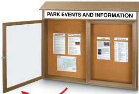
Front Swing Open