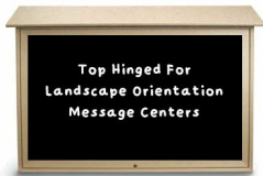
OVERHANG ROOF (BACK VIEW)