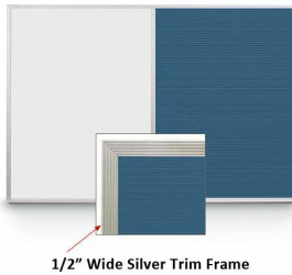
1/2" Wide Silver Trim Frame