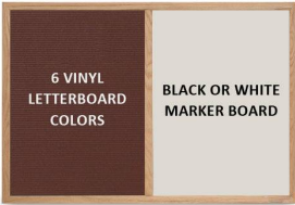
YOU CAN CHOOSE EXACTLY HOW YOU WANT YOUR COMBO BOARD TO LOOK!