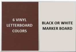
YOU CAN CHOOSE EXACTLY HOW YOU WANT YOUR COMBO BOARD TO LOOK!