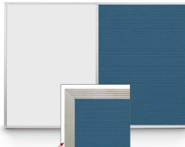
1/2" Wide Silver Trim Frame