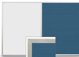
1/2" Wide Silver Trim Frame