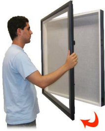
(OPTIONAL) CONCEALED LIGHTING