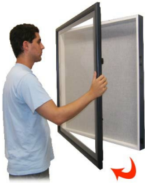
16 x 20 EXTRA LARGE SWING-OPEN CORK DISPLAY CASE (PICTURES SHOWN, NOT TO SCALE)

Custom Display Case sizes, custom Display Case frames, deep Display Case sizes, lighted Display Case, matboard colors, side locks for security, cork board backer, fabric backer, and optional shelves ( Call for Details )