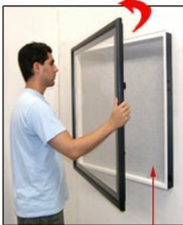
6" INTERIOR DEPTH