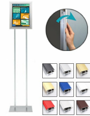
SINGLE or DOUBLE SIDED