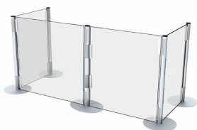
Acrylic Panels NOT included