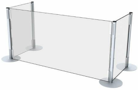
Acrylic Panels NOT included