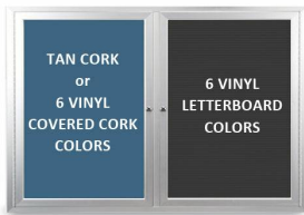
YOU CAN CHOOSE EXACTLY HOW YOU WANT YOUR COMBO BOARD TO LOOK!