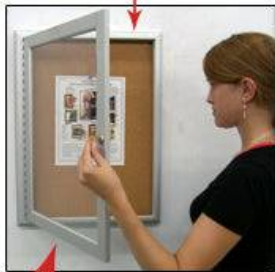
Frame Swings Open- Security Cam Lock On Front